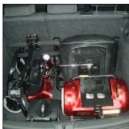
Ideal for most car boots