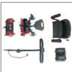
Five compact parts